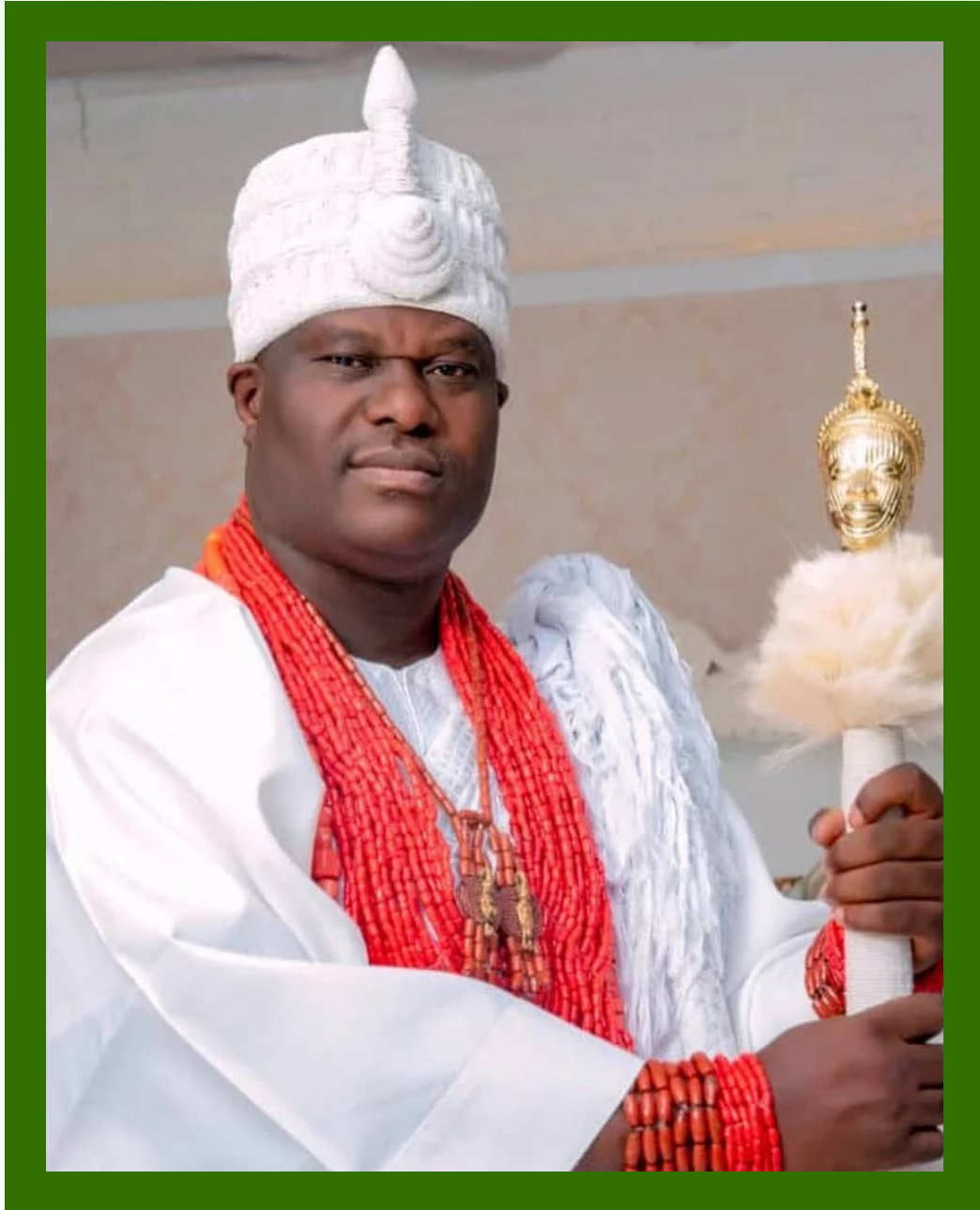
Arole Oduduwa, Olofin Adimula Ooni Adeyeye Enitan Ogunwusi Ojaia II, CFR. Co-Chairman, National Council of Traditional Rulers of Nigeria