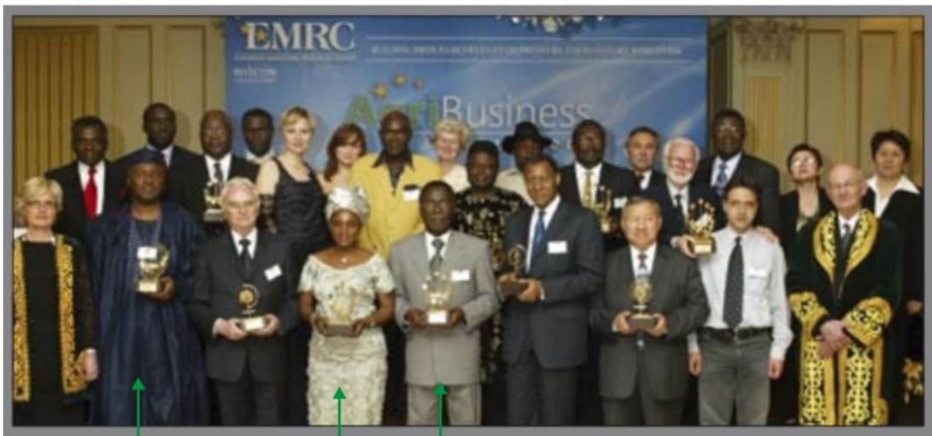
Sen. Bukola Saraki

The European Market Research Center, EMRC Award Recipient in Brussels-Belgium which took place in April 2004.