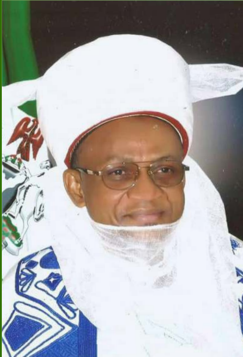
HRH Alh. (Dr) Yahaya Abubakar, CFR ETSU NUPE

Chairman, Coordinating Committee. National Council Of Traditional Rulers Of Nigeria